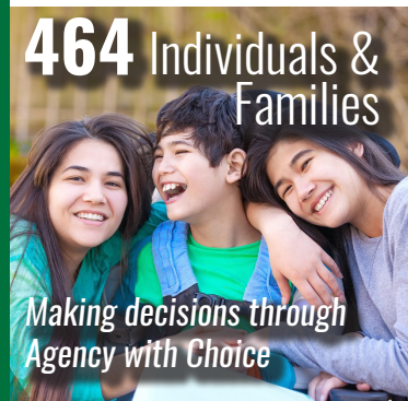
464 Individuals & Families Making decisions through Agency with Choice