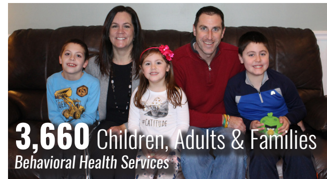
3,660 Children, Adults & Families Behavioral Health Services