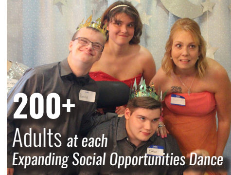
200+ Adults at each Expanding Social Opportunities Dance