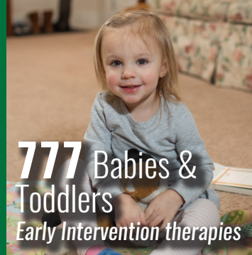
777 Babies & Toddlers Early Intervention therapies