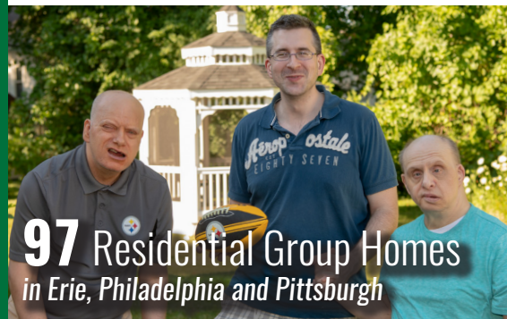
97 Residential Group Homes in Erie, Philadelphia and Pittsburgh