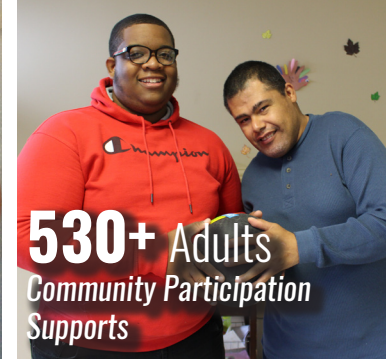
530+ Adults Community Participation Supports