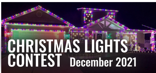
CHRISTMAS LIGHTS CONTEST December 2021