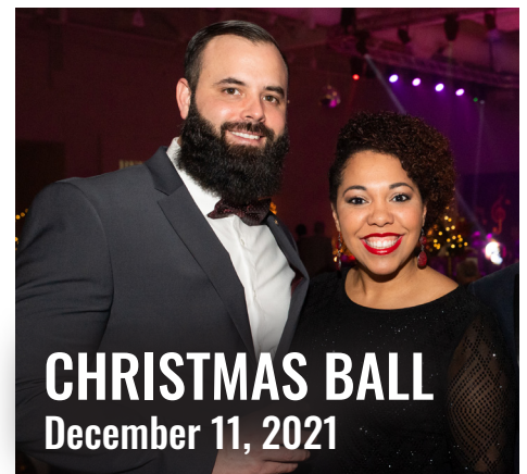
CHRISTMAS BALL December 11, 2021

Includes four reservations, website promotion, inclusion in program and recognition at the event.