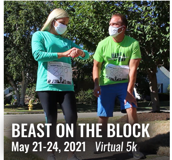
BEAST ON THE BLOCK May 21-24, 2021 Virtual 5k