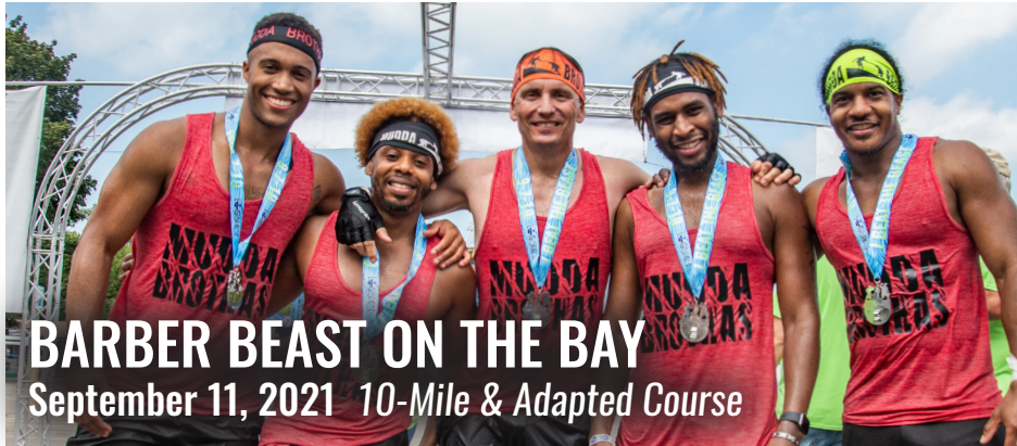
BARBER BEAST ON THE BAY September 11, 2021 10-Mile & Adapted Course

Proceeds benefit the Barber National Institute, an organization committed to “making dreams come true” for children and adults with autism, intellectual disabilities and behavioral health challenges.