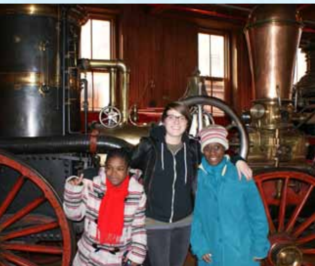
Staff and adults in Community Endeavors visit Philadelphia's Fireman's Museum, site of the country's first firehouse.