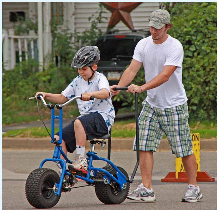
Warren youngsters found success at the "Ready, Set, Ride!" camp.

Small Business Alternatives Smith Collision, Inc Smrcka & Sons Sonneys Photography Employees Sparklezone, LLC Saint Vincent Health Center Staples Sullivan Supply Company Sweet Temptations TeamTurf Landscaping The Breakfast Place The Columbus Foundation The Regency Account The United Fund of the Corry Area, Inc. Tipperary West TOPS Market Tracy's Excavating Trawka's Market Trott Concrete Contractors Union City Country Club United Charities Of Hamot Health Foundation United Way of Allegheny County United Way of Buffalo & Erie County United Way of Erie County United Way of Greater Philadelphia & Southern New Jersey United Way of the Capital Region UPMC Hamot Vantage Care Apothecary Viking Plastics, Inc. Vincent Cifelli Auto Service Vorsheck Family Foundation, Inc. Wal-Mart Foundation Welders Supply WICU-TV Willits Pharmacy Services, Inc. Windsor Beach Technologies, Inc. WJET/Nexstar Broadcasting, Inc. Wm. T. Spaeder Company, Inc. Yaples Vacuum Cleaners & Sewing Center